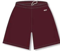
AS1300 - Maroon