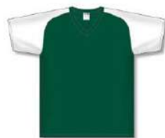
A1375 - Dark Green/White