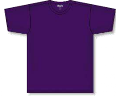
A1800 - Purple