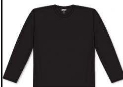
A1900 - Black