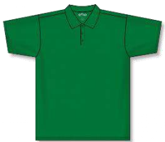
A1810 - Kelly