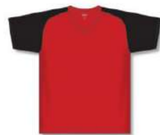
A1375 - Red/Black