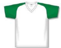
A1375 - White/Kelly