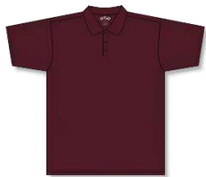
A1810 - Maroon