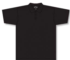
A1810 - Black