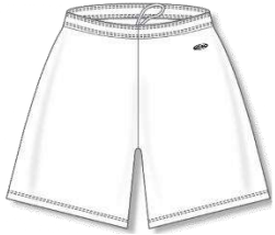
AS1300 - White

Dryflex - 100% Polyester - Moisture Wicking - Without pockets