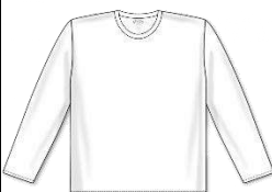
A1900 - White