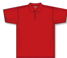
A1810 - Red