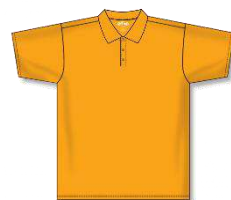
A1810 - Gold