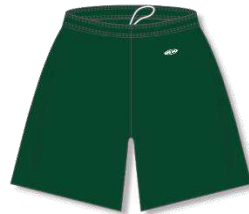
AS1700 - Dark Green