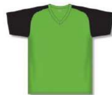
A1375 - Lime Green/Black