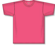
A1800 - Pink