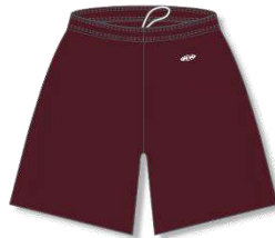
AS1700 - Maroon