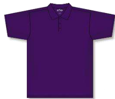
A1810 - Purple