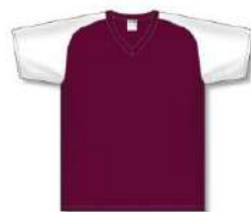
A1375 - Maroon/White