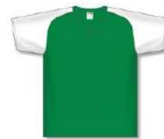
A1375 - Kelly/White