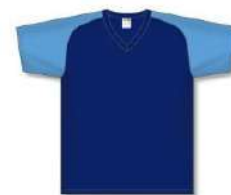
A1375 - Navy/Sky