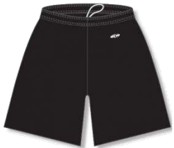
AS1700 - Black

Dryflex - 100% Polyester - Moisture Wicking - With pockets