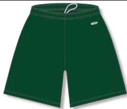
AS1300 - Dark Green

Dryflex - 100% Polyester - Moisture Wicking - With pockets