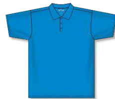
A1810 - Pro Blue