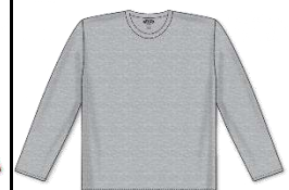
A1900 - Heather Grey