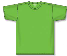
A1800 - Lime Green