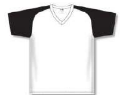
A1375 - White/Black