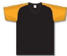
A1375 - Black/Gold