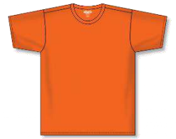
A1800 - Orange