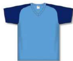
A1375 - Sky/Navy