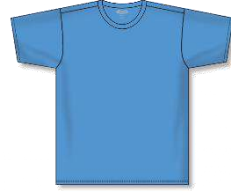
A1800 - Sky