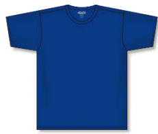
A1800 - Royal