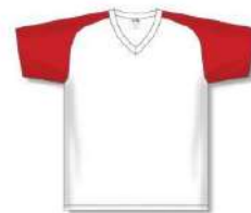
A1375 - White/Red