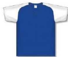
A1375 - Royal/White