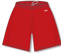
AS1300 - Red