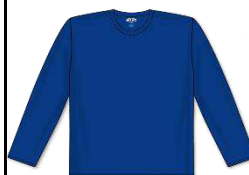
A1900 - Royal