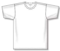
A1800 - White

Dryflex or Actiflex - 100% Polyester - Moisture Wicking