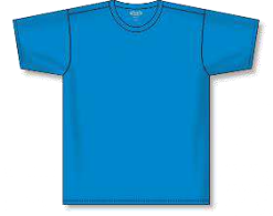
A1800 - Pro Blue