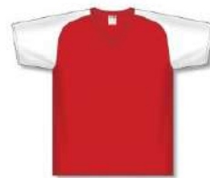
A1375 - Red/White