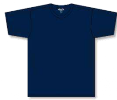
A1800 - Navy