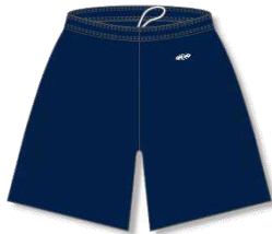
AS1700 - Navy