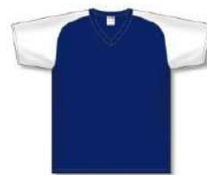
A1375 - Navy/White