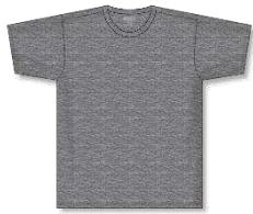
A1800 - Heather Charcoal