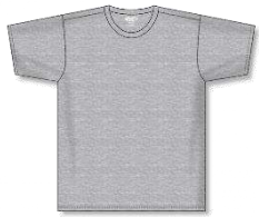
A1800 - Heather Grey