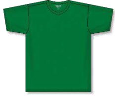
A1800 - Kelly