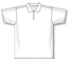
A1810 - White

Actiflex - 100% Polyester - Moisture Wicking