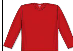
A1900 - Red