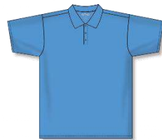
A1810 - Sky