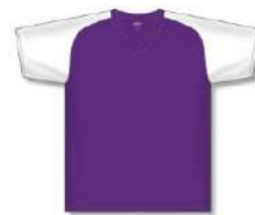
A1375 - Purple/White