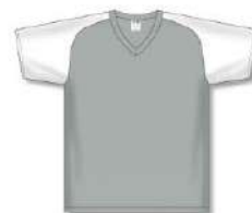
A1375 - Grey/White