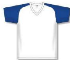
A1375 - White/Royal