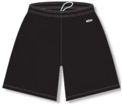
AS1300 - Black