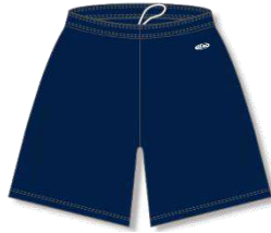
AS1300 - Navy