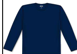
A1900 - Navy