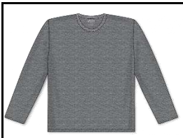
A1900 - Heather Charcoal