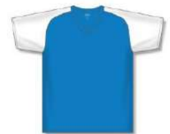
A1375 - Pro Blue/White