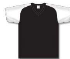
A1375 - Black/White