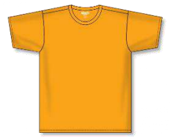
A1800 - Gold