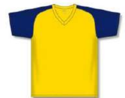
A1375 - Maize/Navy