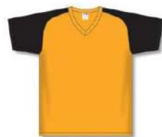
A1375 - Gold/Black