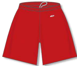
AS1700 - Red