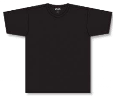
A1800 - Black