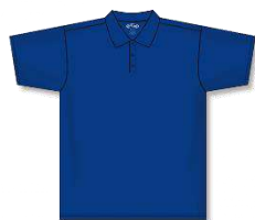
A1810 - Royal