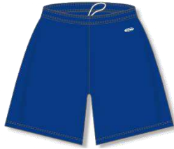
AS1300 - Royal