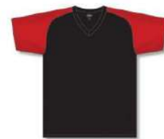
A1375 - Black/Red