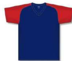
A1375 - Navy/Red