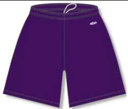
AS1300 - Purple