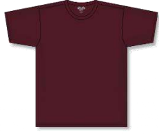
A1800 - Maroon