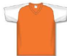
A1375 - Orange/White