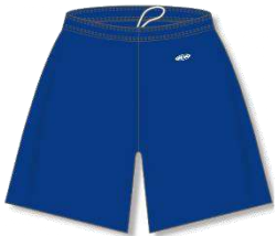
AS1700 - Royal