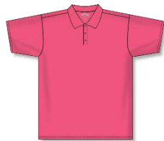
A1810 - Pink