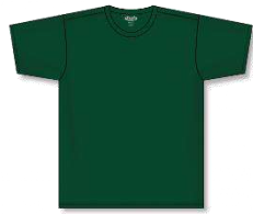
A1800 - Dark Green