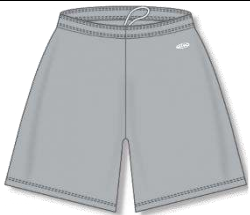
AS1300 - Grey