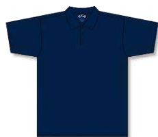
A1810 - Navy