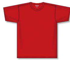
A1800 - Red